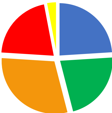
UK fuel source of electricity generation, 2015